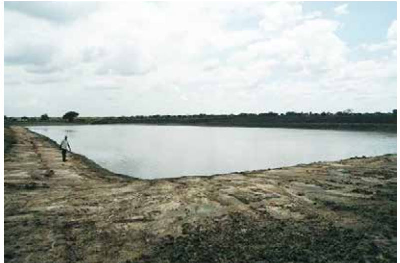
Completed Onganyakonye valley dam in nganyakonye Village, Amaseniko Parish, Kapelebyong District

Communities trained to set up and manage 48 ha of rehabilitated rangelands. Two pasture seed banks were established. The activities were slowed down by prolonged rains. Marketing infrastructure including livestock markets, slaughter sheds and cattle crushes were at varying stages of construction. The completion rates ranged between 80% to 100%.