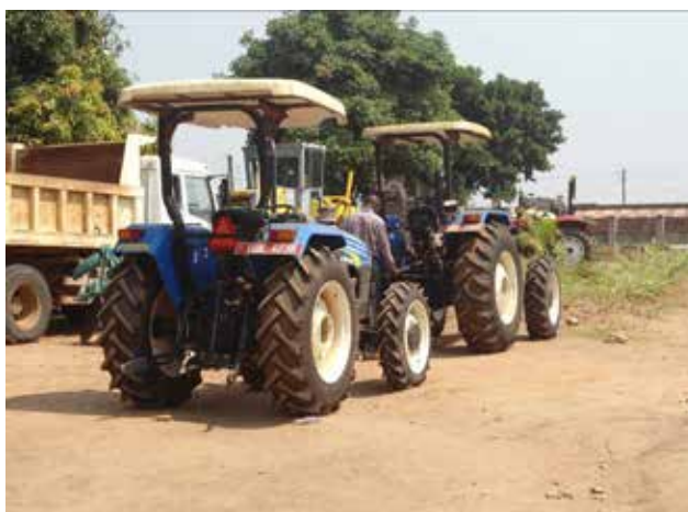
NAADS/OWC tractors awaiting collection by farmers at Maracha District headquarters (left) and Kiryandongo District headquarters (right)