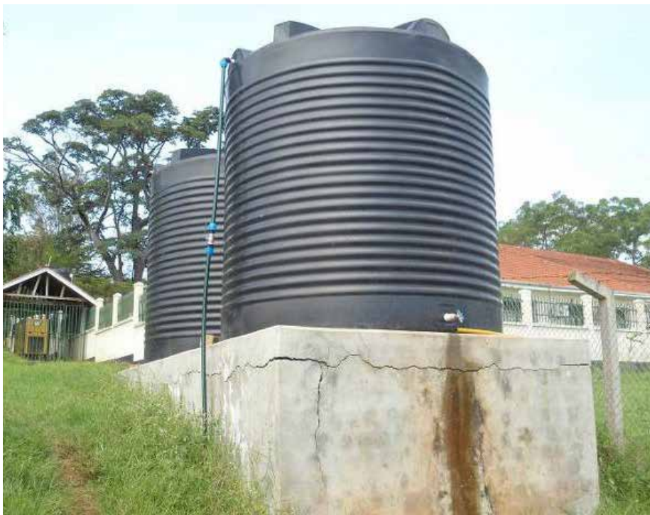
Recently constructed foundation with cracks at NACORI in Mukono District

The National Coffee Research Institute (NaCORI) is located in Kizuza Village, Ssaayi Parish, Ntenjeru Sub-county in Mukono District. Research was undertaken, with support from the Uganda Coffee Development Authority (UCDA), to develop high yielding and disease resistant Robusta coffee and cocoa varieties and associated agronomic practices that could enhance performance. Selections of Coffee Wilt Disease Resistant Robusta hybrid clones was undertaken on station and on-farm in selected districts. High yielding, disease and pest tolerant clones were under experimentation. Coffee planting materials were produced and disseminated to farmers. Coffee value addition and climate smart agriculture experiments were undertaken.