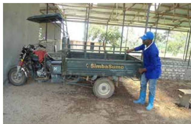
ACF funded tricycle parked in the recently established cow kraal in Masaka District

M/S Jovah International Limited in Kititi Village, Kyantale Parish, Kyanamukaka Subcounty in Masaka District received Ug shs 230 million that was used to renovate a poultry house and stocking 4,500 birds; construct a store and cow kraal; establish an irrigation system that was at 20% completion; and procure a tricycle, 11 bee hives and 6,000 coffee seedlings. The kraal was expanded with own resources from the planned holding capacity from 10 cows under the ACF arrangement to 42 cows. Due to labor scarcity, less coffee seedlings were procured against the planned 10,000 seedlings.