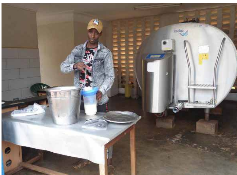
Hygiene observed at Masindi MCC in Masindi Municipality due to frequent supervision by DDA

In the North-Eastern region, 87 premises/equipment were inspected in Mbale, Sironko, Bududa, Ngora, Kumi, Kaberamaido, Kapchorwa, Amuria and Manafwa districts; 54 premises/equipment (62.06%) were compliant to dairy standards. Out of the 50 raw milk samples analysed from Soroti and Mbale municipalities, 20 samples were adulterated with water. All the UHT milk samples analysed had some added water ranging between 7% and 18%.