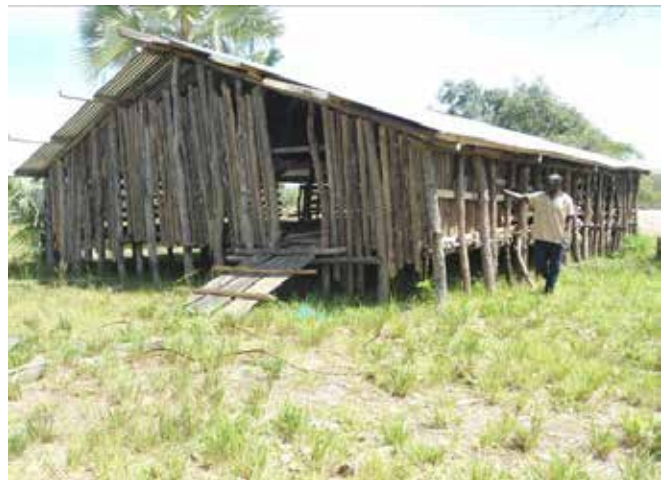
Apiary project (left) and goat house established at Aswa Ranch in Pader district