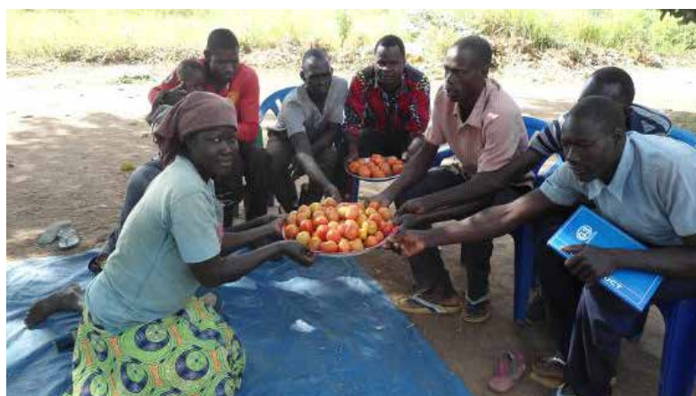
Purber Farmers Group in Kona Ward Village, Paicho Subcounty, Gulu District with the produce from the NUFLIP supported gardens

Amuria District: They started work with 2 groups (Tim Kica Farmers Group in Obbo Parish) and (Legatek Farmers Group in Guraging Parish) in 2018 up to 2019 November; the 2 groups graduated in November 2019. Each group benefitted from 15 training sessions before accessing fertilisers, watering cans, chemicals and seeds from JICA. The first group was given tomatoes, and green paper, while the second group received tomatoes and cabbages. A third group was enrolled (Ribbe Ber Youth Group in Palema Parish) and trained. The group members had their own activities at individual level. Trainings were constrained by low turn up of farmers due to long distances and lack of allowances.