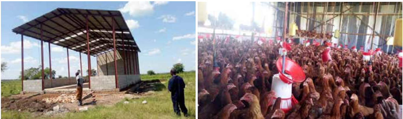
Hay barn construction near completion (left) and part of the multipurpose poultry received from NAGRC & DB Headquarters at Lusenke Stock Farm

There was a modest growth (45) in the cattle herd from 635 animals on 1 st July 2019 to 680 animals by 31 st December 2019. A total of 24 cattle died due to tick borne diseases, weather related problems and old age. A total of 41 animals were slaughtered during the visit of a Parliamentary Committee, district leaders and a Presidential meeting. A total of 9,597 poultry birds were received, of which 1,482 (15%) had died by 31 st December 2019 due to stress/congestion and cannibalism arising from inadequate space and feeds. Key challenges were suffocation of animals and birds due to floods and mud, delayed disposal of animals, impassable access roads and understaffing.