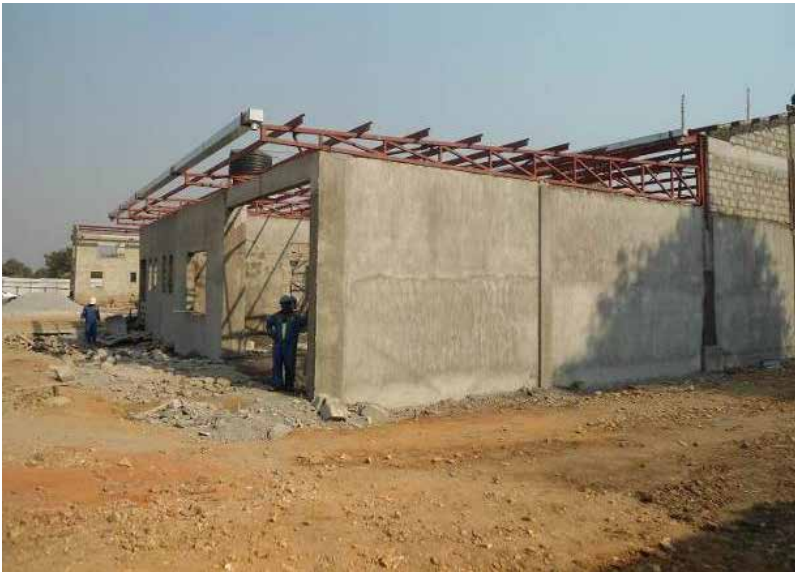
OWC financed mango processing factory under construction in Yumbe District

Inputs that were distributed directly from OWC suppliers to other stakeholders such as churches and politicians were not verified by the district and could not be accounted for. For example, Amuru District Local Government did not verify the viability of cassava cuttings that were distributed directly to the Catholic Diocese. The survival rate of heifers that were distributed in Acholi region in FY 2018/19 was low due to: a) inadequate knowledge and skills among farmers with regard to looking after improved breeds b) abrupt delivery of animals when farmers were not ready to look after them c) poverty and lack of funds to sustain the animals. In Pakwach District, maize was rejected due to late delivery at the onset of the dry season.