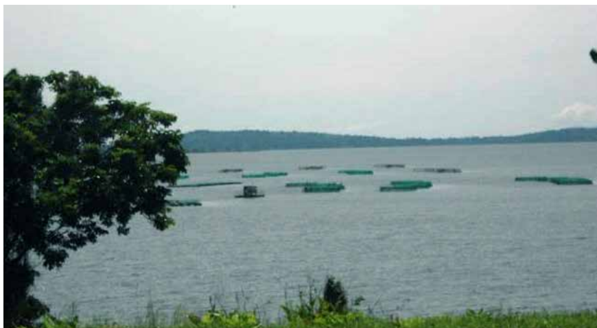
Fish cages established by Lake Victoria Precious Fish Limited in Mukono District

Lake Victoria Precious Fish Limited in Bukule Village, Mpata Sub-county, Mukono District accessed Ug shs 400 million that was used to procure fish cages and accessories. Key challenges were: Less funds disbursed than what was requested for; a time lag of eight months between loan application and access to funds; and inadequate technical guidance from the bank during loan packaging as the staff lacked sufficient knowledge on risk assessment of agricultural projects.