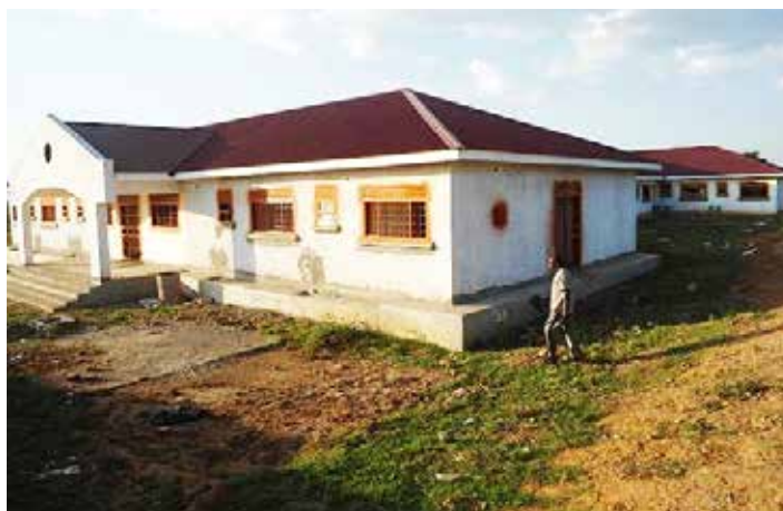
Administration offices under construction at Rubona Stock Farm in Bunyangabo District

The station is located in Kayonza Village, Kayonza Parish, Kikatsi Sub-county in Kiruhura District. The cattle herd increased modestly (55) from 3,572 animals on 1 st July 2019 to 3,627 animals by 31 st December 2019. There were significant cattle births (381 animals) during the period; however there were also large animal sales (232) during the period. During the same period, the goat herd increased significantly from 1,590 to 1,750 animals, a net increase of 160 animals. A high level of goat mortality (202) was noted due to inadequate housing, poor quality pastures and high prevalence of diseases.