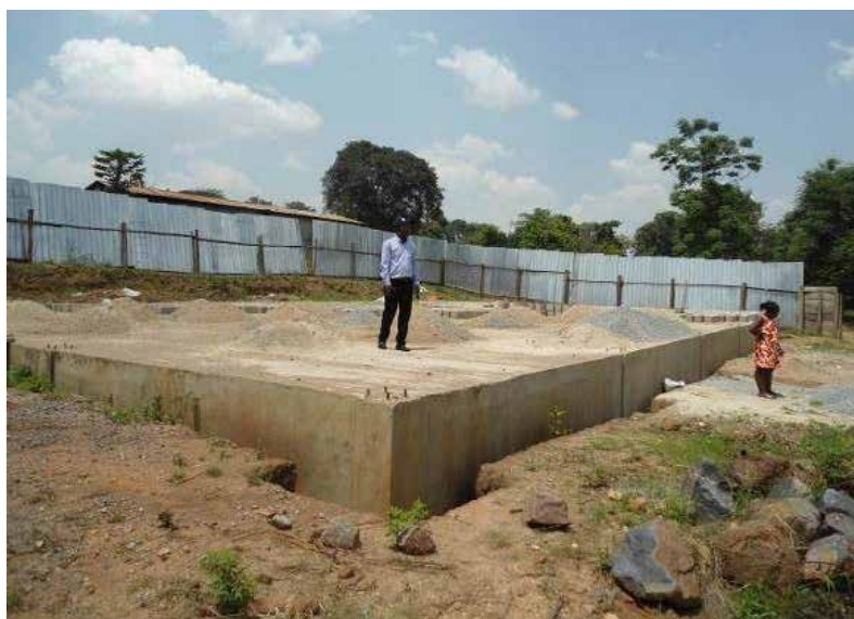
Slab for seed sorting building was 100% complete at Mbazardi in Mbarara District

Mbarara ZARDI is located in Mbarara Municipality, Mbarara District. On station and on-farm experiments on the interaction between agro-forestry, bean production and aphid effects were undertaken. One research protocol on improving banana productivity through innovative soil fertility and moisture management and control of diseases was produced. Brood stock of catfish were obtained and conditioned in concrete tanks at NaFIRRI and Kajjansi Station. Research was initiated on enhancing the quality of ghee to support the cottage industry in the region.