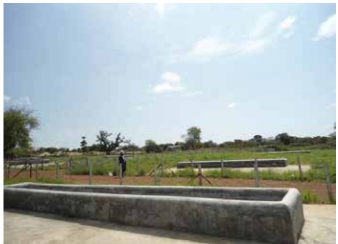
L-R: Completed slaughter shed but with flooded courtyards in Katakwi Town Council in Katakwi District; Completed cattle market in Akore Town Board, Akoromit sub-county in Kabelebyong District

Some districts faced unique challenges: In Amuria, construction works were slow and the contractors abandoned the sites at times. The district was not involved by MAAIF in the contracting process, did not have key bid documents and hence could not supervise the contractors. Government funds were wasted as some staff were paid salaries by the project yet they did not execute any work. The drainage systems were dysfunctional and courtyard not paved for the slaughter shed in Katakwi Town Board which led to flooding and inaccessibility during the rain seasons.