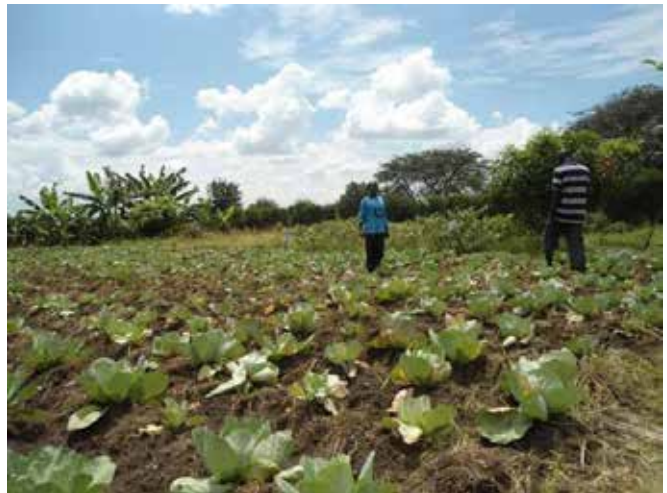
Project demonstration gardens at St. Mary's Kaihura Primary School in Kaihura village Butiiti subcounty Kyenjojo district (left) and St. Peters Primary School Nyakasanga in Umoja village Kasese Municipality Kasese District (right)

Key activities implemented at district, school and community level mainly using balances from FY 2018/19 or borrowed funds included setting up new and maintaining existing demonstration gardens; school based nutrition education for students and Parent Groups; holding community meetings to sensitize them about nutrition good practices and cookery demonstrations; and project monitoring and supervision.