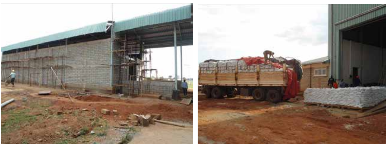
Ongoing construction of bale shed (left) and bags of dressed seed being loaded at the CDO Cotton Dressing Station in Pader District

Several structures that were planned to be implemented by phase 2 had not been constructed due to inadequate funding. These were: three stores; multi-purpose hall and offices; dining hall; kitchen and canteen; staff accommodation; mechanical workshop; and external works (drive ways, landscaping, drainage).