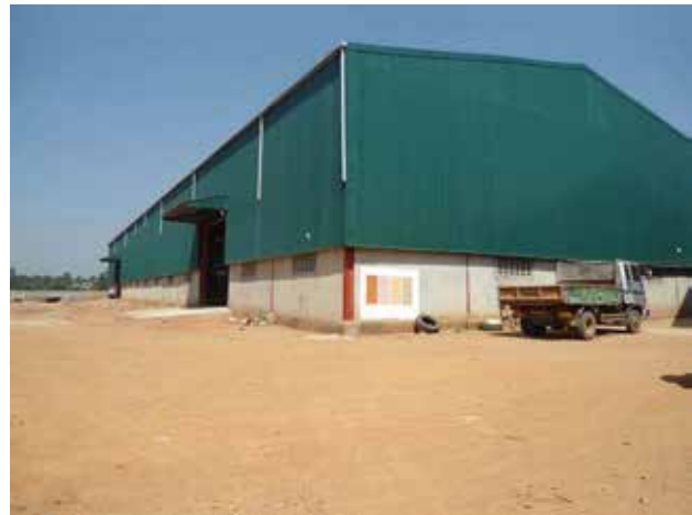
Warehouse (left) and silo base (right) constructed at Biryia United Agencies Ltd in Mbarara District