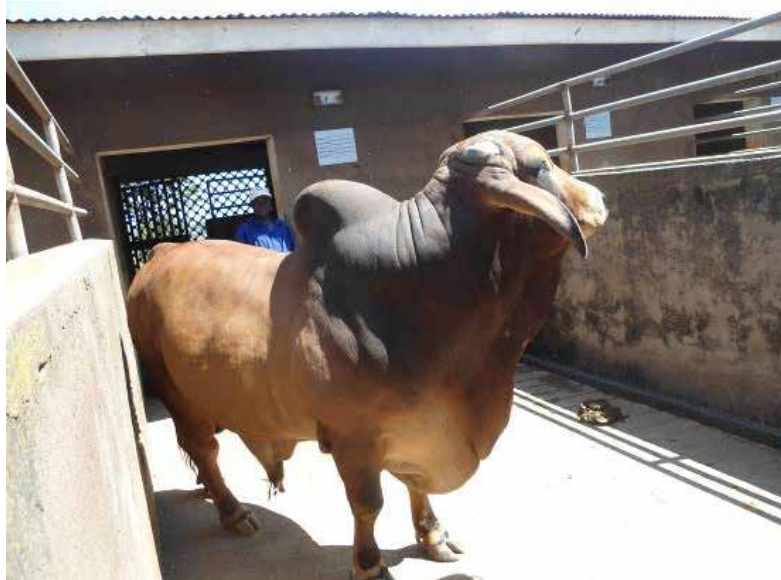
One of the 26 bulls being maintained at the bullstud at LES in Entebbe Municipality, Wakiso District

programme was low due to inadequate staffing as some of the personnel were engaged in delivering AI materials in the field; delayed disposal of eight old unproductive bulls; slow procurements and delivery of equipment and materials by suppliers; and inadequate budget in LGs to promote AI effectively.