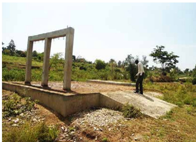
Slaughter slab constructed in Bugweri District with the sectoral grant

By 31 st December 2019, a slaughter slab in Kikunyu Village, Idudi Parish, Buyanga Parish, Bugweri District had been re-constructed. The initial completion date was April 2018 (FY 2018/19). However the slab was effected by the harsh climatic conditions. Renovations were completed by 31 st December 2019.