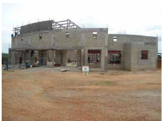
The conference hall under construction (left) and administrative buildings under renovation (right) at Rwebitaba ZARDI in Kyenjojo District