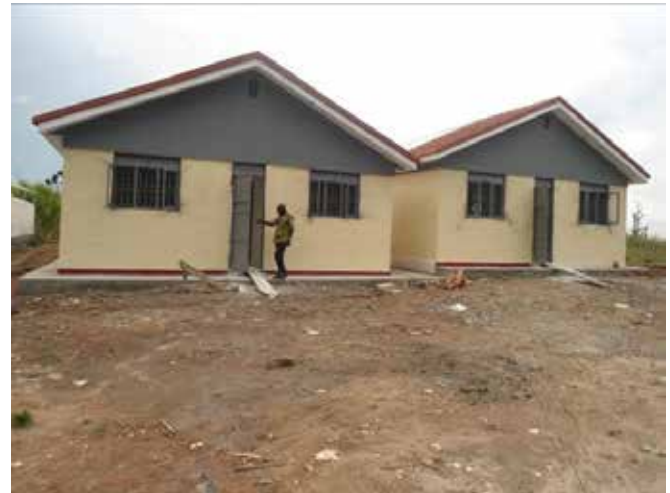
Mechanical workshops (left) and screen houses (right) near completion at NASRRI in Serere District