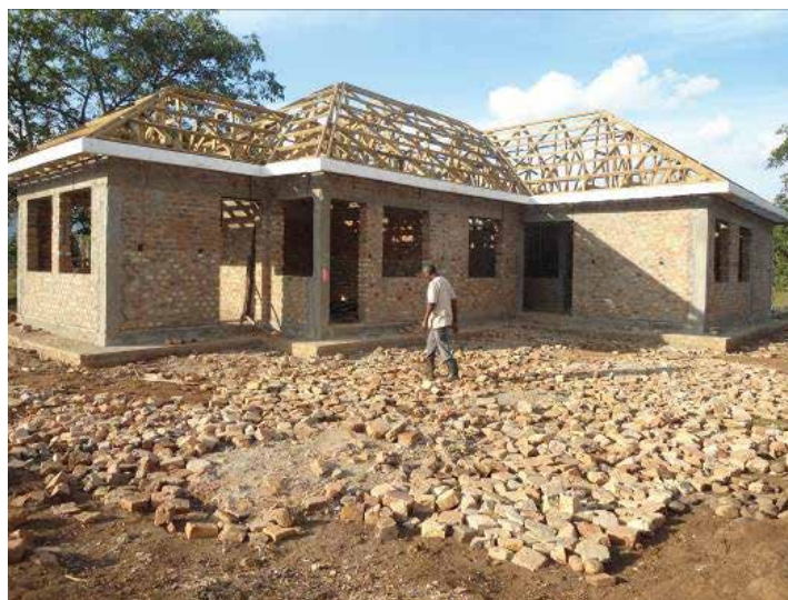
Administration offices under construction at Rubona Stock Farm in Bunyangabo District

Rubona Stock Farm is located in Buhuna Village, Buhuna Parish, Rubona Town Council in Bunyangabo District. The farm registered a small growth (16) in cattle herds from 496 animals on 1 st July 2019 to 512 animals on 31 st December 2019 and negative growth (-16) for the goat herds from 191 to 175 animals during the same period. The factors that contributed to the small growth in the cattle herd were: 37 animals were sold, of which 21 were sold to the National Enterprise Corporation (NEC) for breeding; 10 heifers were donated to a women's organization in Kasese District and 12 animals died due to weather related diseases including pneumonia. Calves got stuck in mud and died.