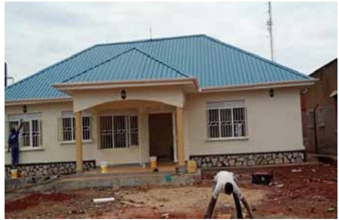
Gulu Milk Collection Centre (left) and DDA Northern Uganda Regional Office (right) at Bus Park Cell, Gulu Municipality in Gulu District

Draft Bills of Quantities for rehabilitation of the National Dairy Analytical Laboratory (NDAL), Entebbe Dairy Training School (EDTS), and Kitgum MCC were developed and awaiting approval; road boundaries for Kyegegwa MCC were being sorted out before contracting the works. Procurement of laboratory reagents, consumables, 40 thermometers and 40 lactometers was ongoing.