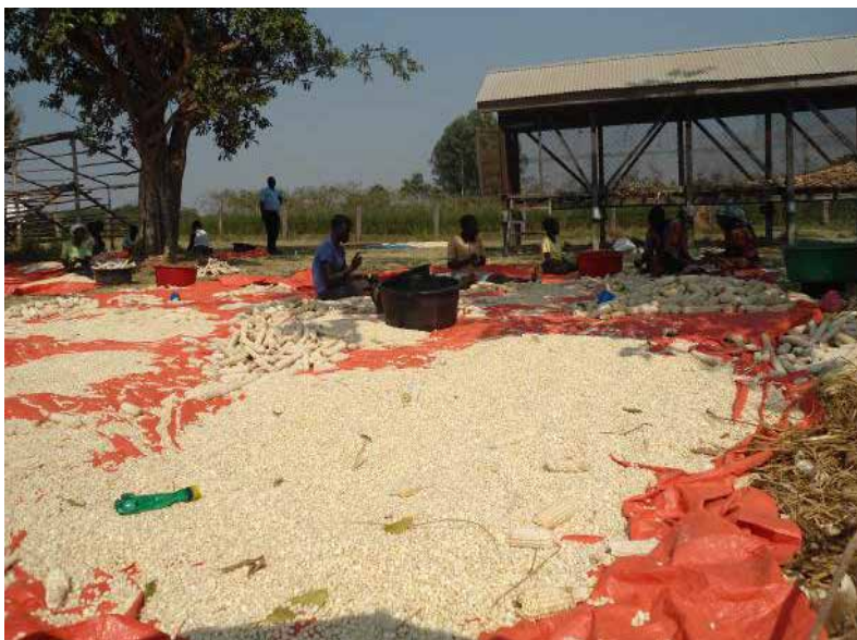
Maize foundation seed under production at Abi Zardi in Arua District

By 31 st December 2019, research to generate technologies and improved agronomic practices was undertaken at the National Agricultural Research Organization (NARO) Zonal Agricultural Research Development Institutes (ZARDIs), Development Institutes and off farm. The detailed performance of selected NARO institutions is presented below.