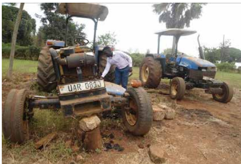
Old non-functional CDO tractors parked at CDO regional office in Kisita Village, Northern Ward, Masindi Municipality, Masindi District

In the Mid-western and Central region, the crop survival rate was low estimated at 60% due to heavy rains and floods that affected germination and harvests and late planting as farmers lacked tractors for timely ploughing. Most tractors in the region were dilapidated and needed replacement. The most affected areas were Kabwooya sub-county and Baseruka sub-county in Hoima District, and Butyaba and Bullisa subcounties in Bullisa District.