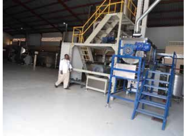
ACF financed sugarcane plantation on Mr. Byenkya's farm in Kiranga village Hoima District

AFRO-KAI Limited located in Katalemwa, Mattuga Village, Gombe Parish, Gombe Sub-county in Wakiso District accessed Ug shs 15.31bn that was invested in commodity trading, acquisition of agro-processing machinery and setting of four fish demonstration ponds one of which was operational. The machinery that was procured included a fish feed facility, fertilizer blending machine, silos facilities and cleaning machinery.